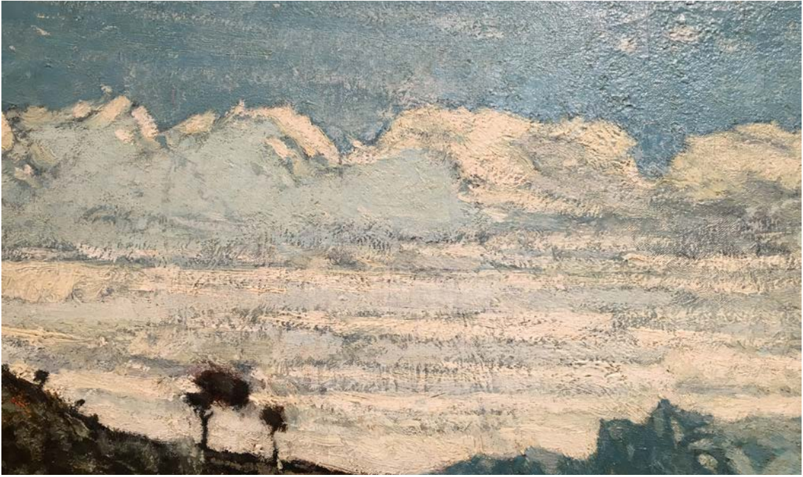
Fig 1.2. Detail from Paysage de Provence .