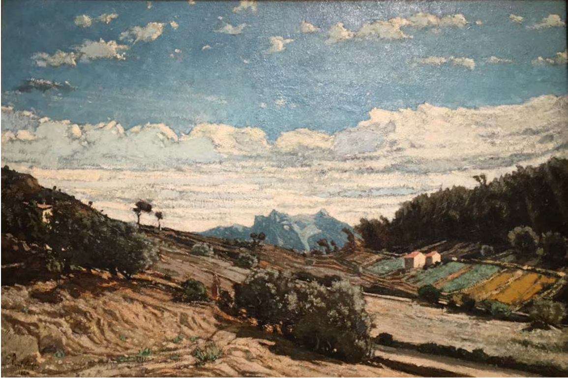
Fig. 1. Paysage de Provence . Paul Guigou, 1860. Oil on canvas.