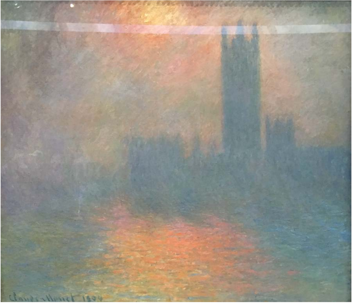
Fig. 3. Londres, le Parlement. Trouée de soleil dans le brouillard. Claude Monet, 1904. Oil on canvas.