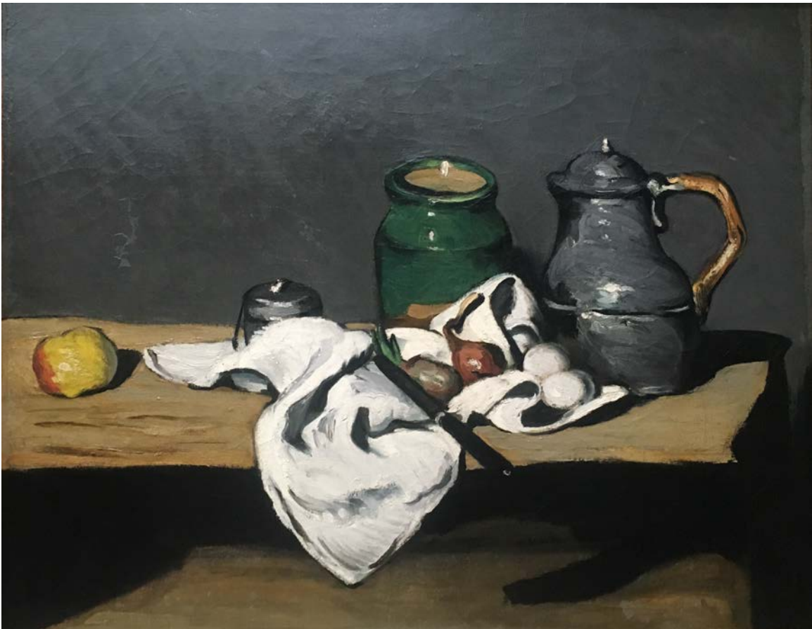
Fig. 2. Nature morte à la bouilloire . Paul Cézanne, 1867-1869. Oil on canvas.