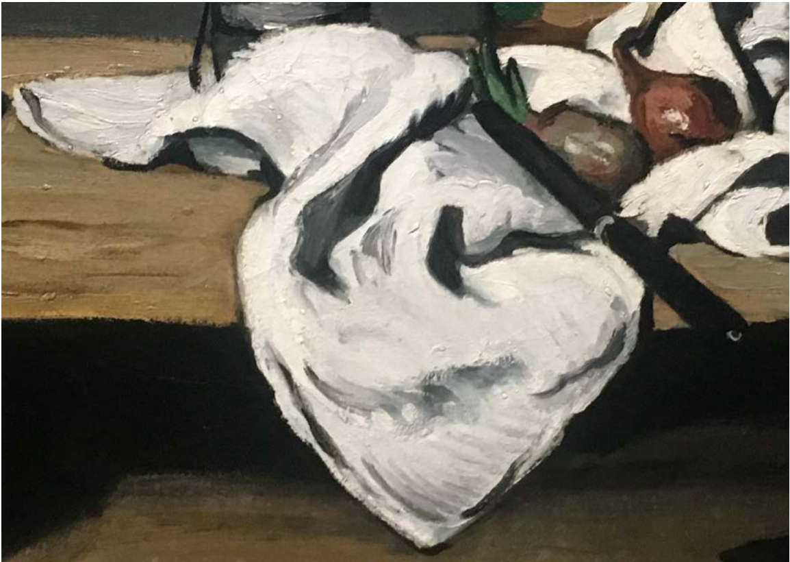
Fig. 2.2. Detail from Nature morte à la bouilloire .