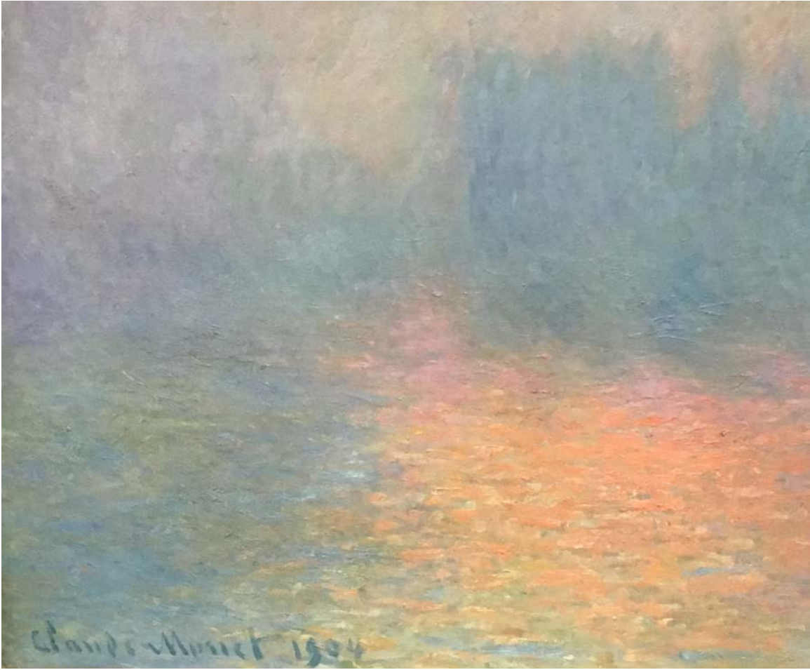
Fig. 3.1. Detail from Londres, le Parlement. Trouée de soleil dans le brouillard .