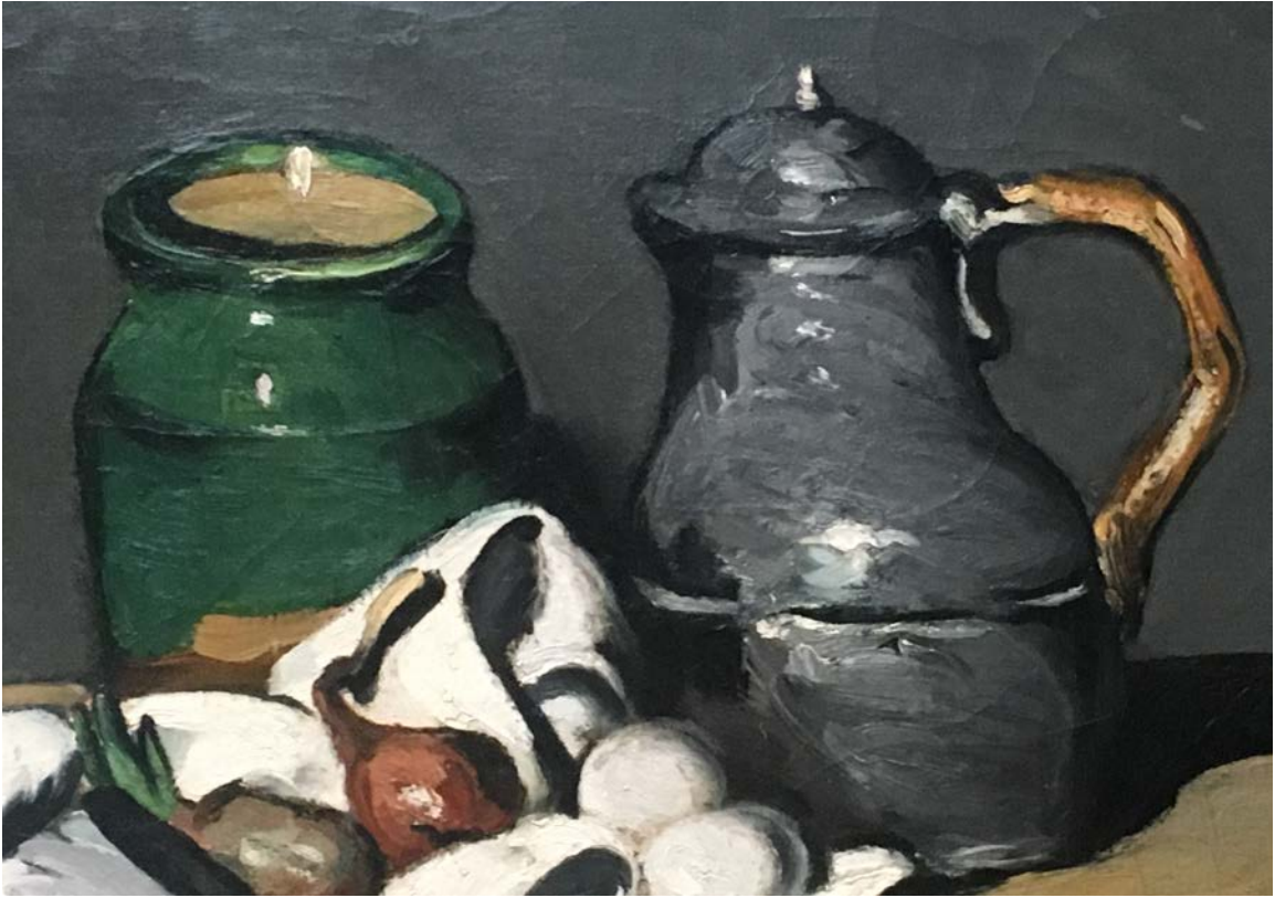
Fig. 2.1. Detail from Nature morte à la bouilloire .