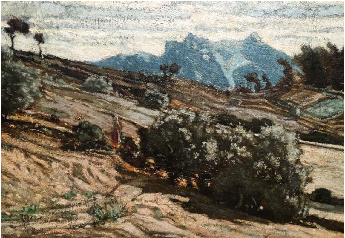
Fig. 1.1. Detail from Paysage de Provence .